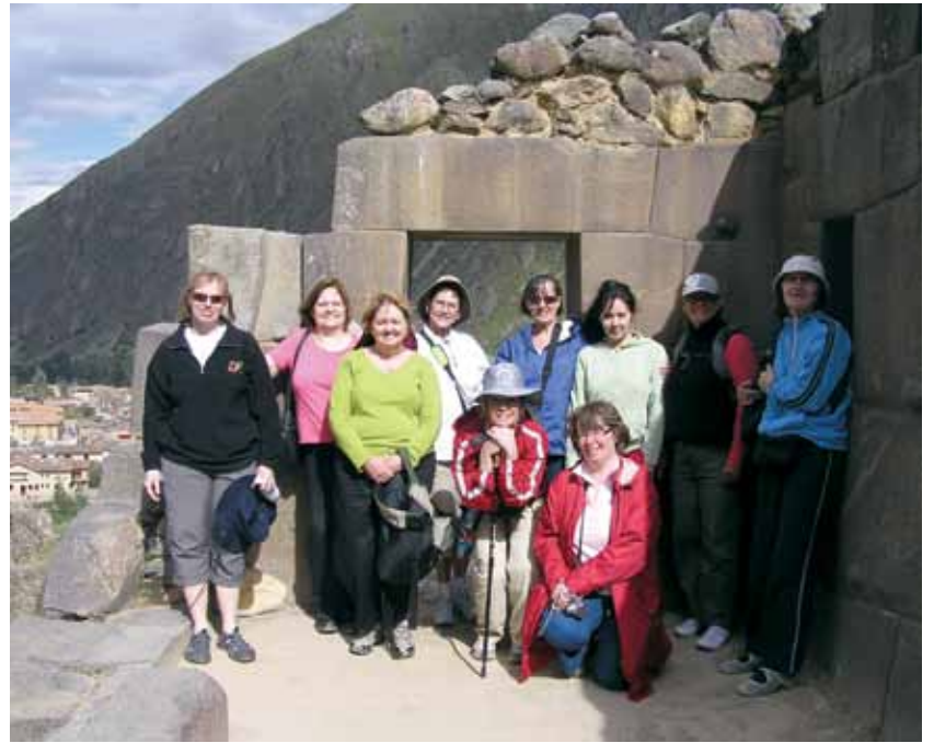
Exploring Cusco, the historic capital of the Inca Empire and an UNESCO World Heritage site.