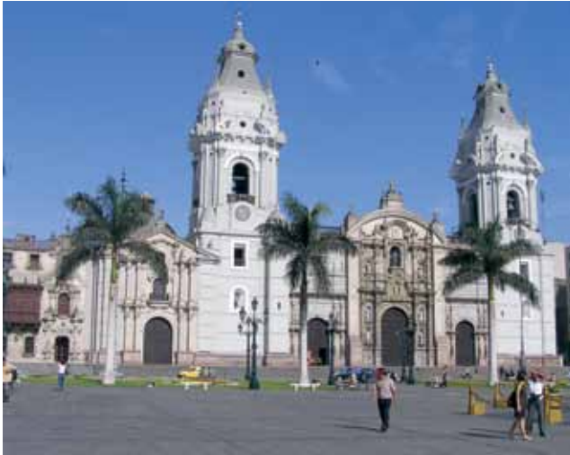
Lima Cathedral reflects Peru's Spanish influence.