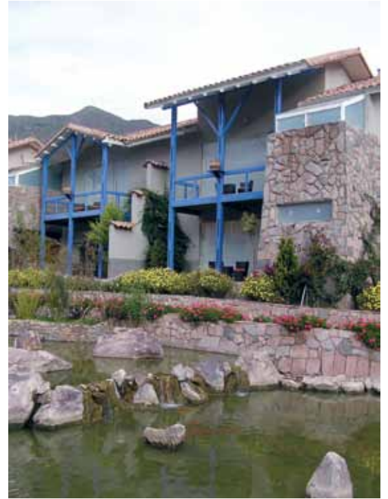
The Arawna Resort in the Sacred Valley.

Words can't explain and pictures don't do justice to the very special places we visited. Staying at Arawna Resort in the Sacred Valley was a treat many of us will not forget. What a gorgeous place to start our visit to the Sacred Valley of the Incas! We wanted to hit "pause" and just take in all the beauty of this new resort—not to mention visiting the spa for a few choice treatments. But Machu Picchu called and it did not disappoint. Your senses are taken over when entering Machu Picchu as all the magical pictures you've seen are suddenly before you in living color. We all just had to stop and take a breath, and then, of course, our cameras came out as we tried to capture what we were experiencing.