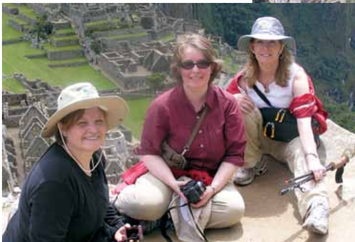
Above: The view from Hauyna Picchu once we arrived—it took our breath away literally and figuratively—but oh, what a sight!