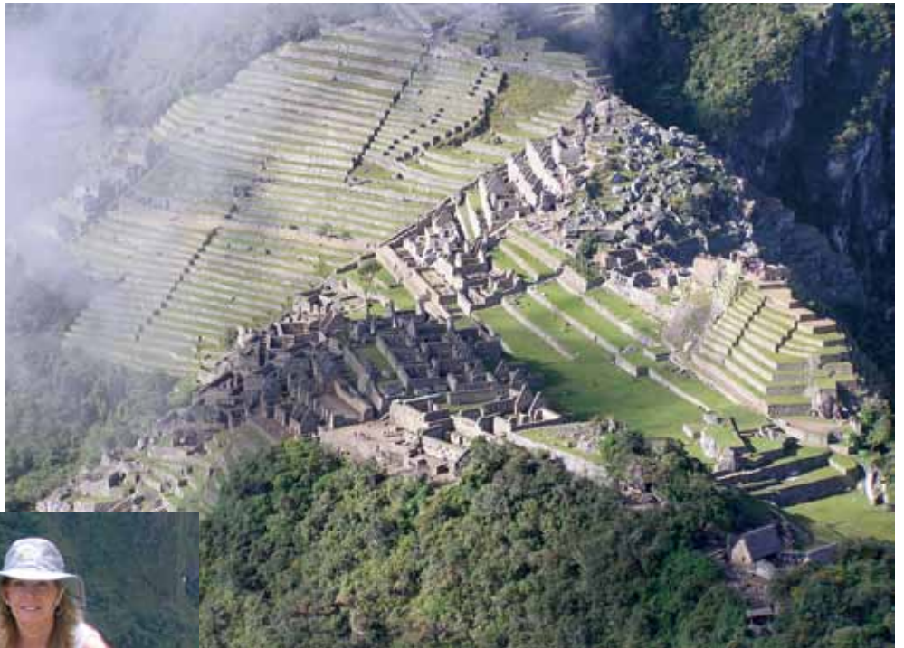
Left: Three travelers taking a break on the climb to the peak of Hauyna Picchu which towers over 1,000 feet above Machu Picchu.