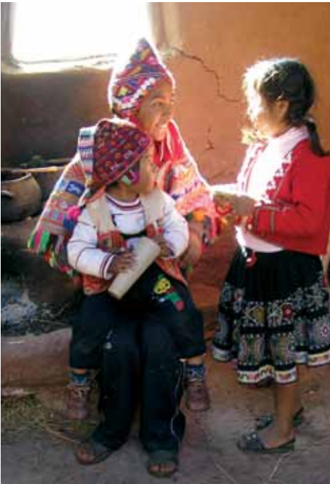
Peruvian children at the alpaca farm.