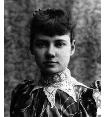
Nellie Bly at the time of her round the world trip.

Feeling restless after this triumph and frustrated trying to come up with new story ideas, one afternoon Nellie said “I wish I was at the other end of the earth!” This got her thinking. She had read Jules Verne’s popular novel Around the World in Eighty Days in which the protagonist, Phileas Fogg, circles the globe in 80 days. Nellie researched steamer (ocean liner) and train schedules worldwide and became convinced she could beat the fictional 80 day record. After almost a year of lobbying for the assignment and ultimately threatening to have another newspaper sponsor her, Nellie finally got her way. On a